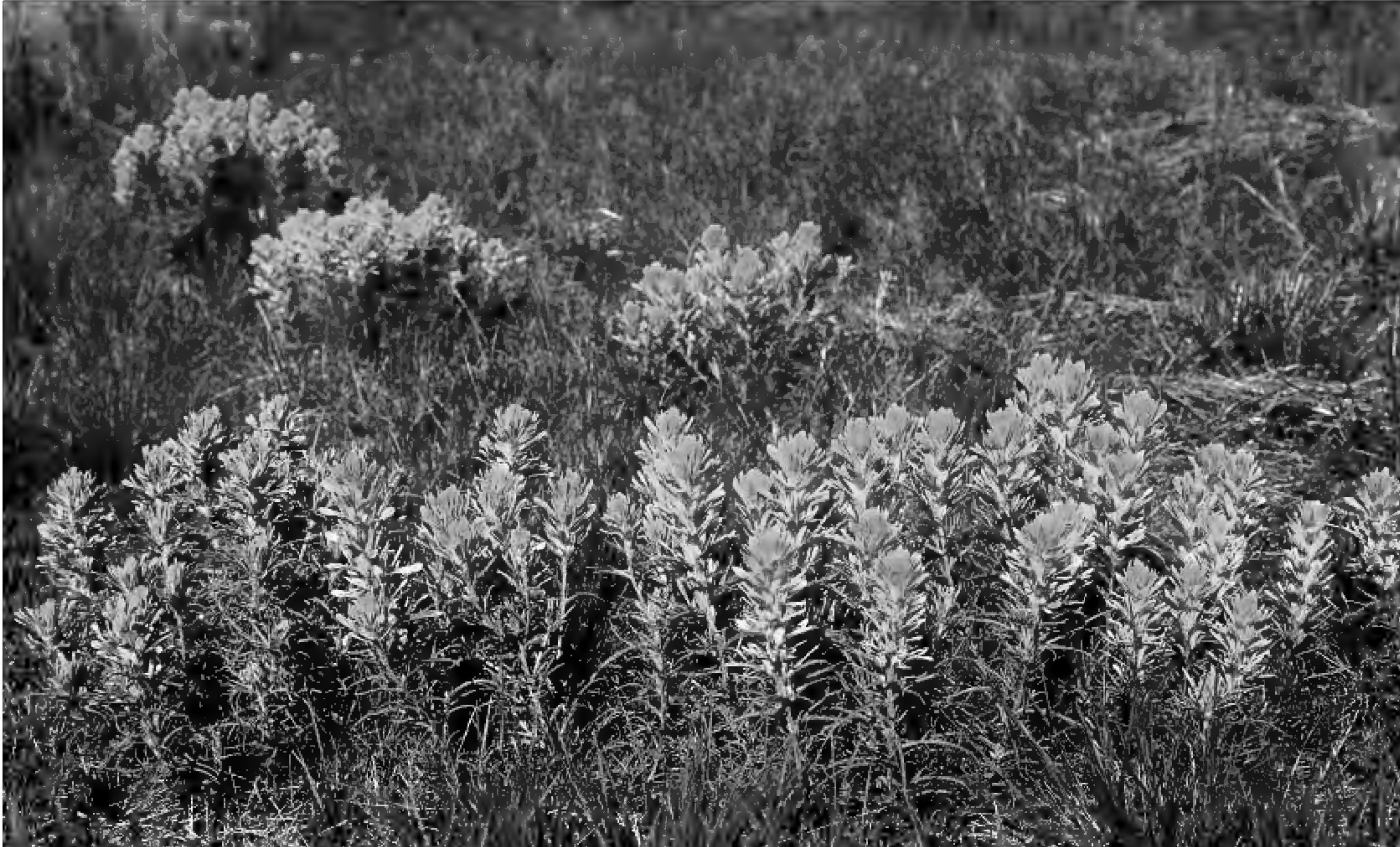
Figure 4. Castilleja citrina in typical form, with immediately adjacent plants of C. purpurea perhaps with influence of C. citrina . Figure 5 shows another view of the same population. Ca. 3 miles east of Talpa, Coleman Co., Texas, 20 Apr 1990. Talpa is the type locality for C. citrina .